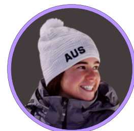
Britteny Cox Mogul skiing world champion 2017